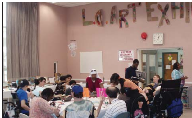
The Life Options program recently held their First Annual Art Exhibit featuring original creations by many program participants.

The other three days a week, we participate in a variety of classes. These classes change every few months and have included things like forensics, music and art appreciation, interviewing skills, writing children's stories, cooking, and computers. The exciting part of the program is that we get to move from classroom to classroom. We are not in one room for the whole day. We also get to attend seminars at least once a month on different topics. These seminars are given by professionals who work in the industry they are presenting on. They give us the opportunity to meet