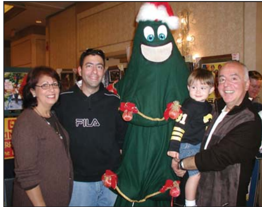
The Festival has something fun for all ages!

The Festival promises to be more exciting and enjoyable than ever! The exhibit of designer-decorated trees (see list of participants) will include many of the most talented and sought-after designers, back with us due to popular