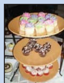
Sweets from Sweet Karma