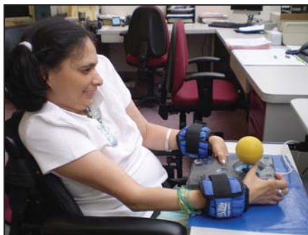
The joystick helps bring new possibilities.