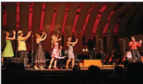
The cast serenades the audience with another fabulous song!