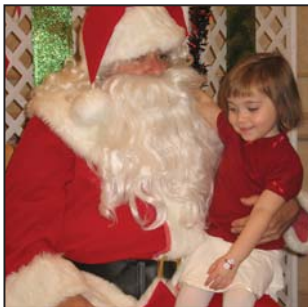
Sharing a special moment with Santa at the Festival