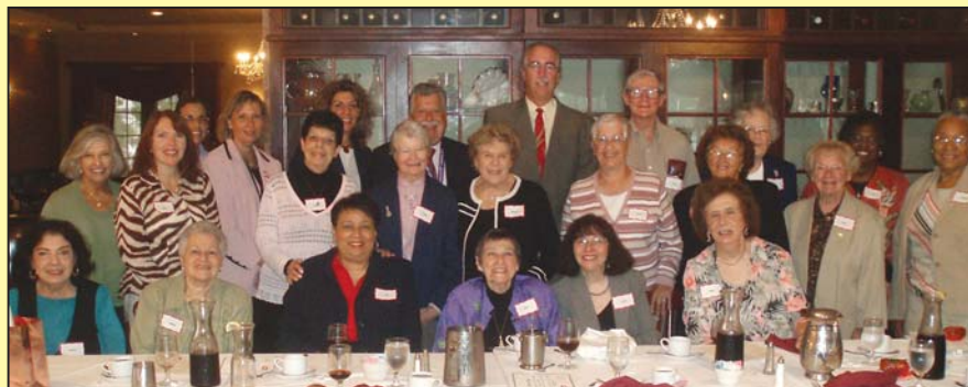
At the Annual ucpn Volunteer Luncheon

On a personal note, as we increase our volunteer base both at our agency and at our events, I want to thank and acknowledge not only our valuable volunteers, but also their supervisors for the easy transition that the volunteers experience once orientation is complete. Included in the smooth behind-the-scenes assistance is the Human Resources Department and Nursing, who are