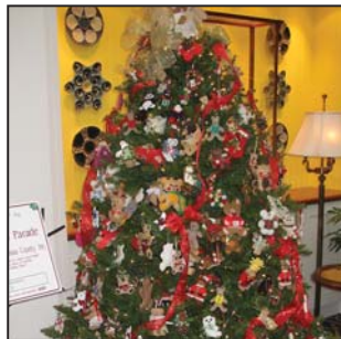
A beautiful tree decorated by the Nassau Homemakers