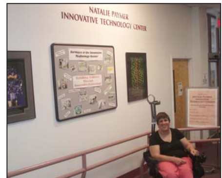
Ready for a visit to the Innovative Technology Center