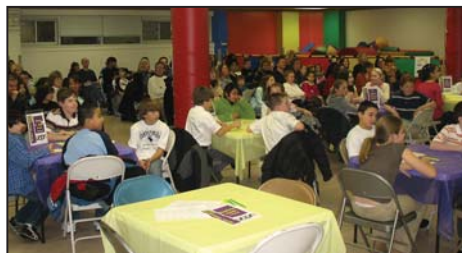
At the 2007 Trivia Challenge Finals Competition at ucpn

fundraises by getting their family and friends to sponsor them based on how many questions they answer correctly on the test. We reward each student with prizes based on how much money they raise. Last year, we raised almost $80,000. The students had so much fun participating and they look forward to it every year.