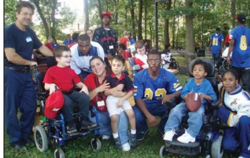
Family members, students, staff and special guests all enjoyed the day!