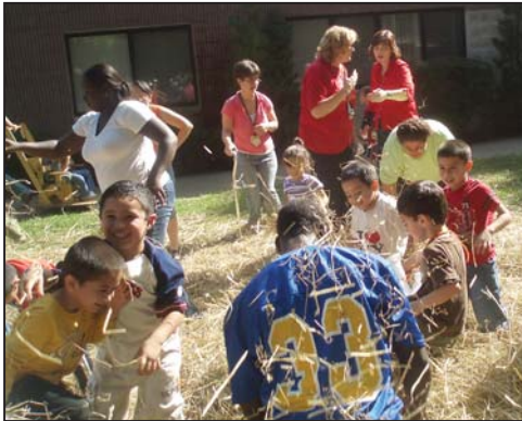
Hay! Everyone enjoys this fun autumn tradition!