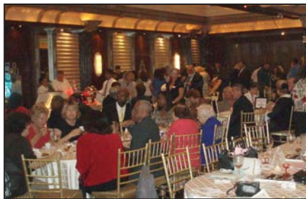
Guests enjoyed delectable treats all evening.