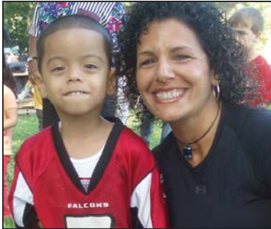
Lots to smile about at this Fall Festival!

This annual Fall Festival was enjoyed by all and special guests from Roosevelt Junior/Senior High School, including the Football Team and the Marching Band made it a spectacular celebration!