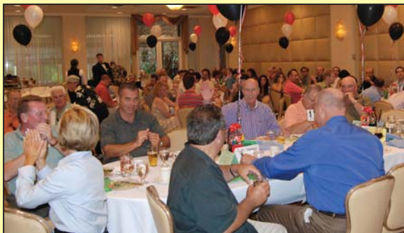
Full house at the 25th Annual Golf and Tennis Dinner gathering