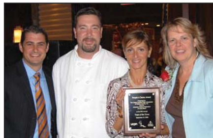
People's Choice -- Sagamore Steakhouse, Syosset