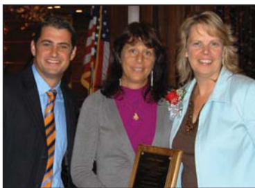
Winning team from Chateau Briand

Palm Bay Teatown Cellars Ltd. Supreme Wines Southern Wine & Spirits Sagamore Steakhouse Vindagra USA Imports Page One Restaurant Manhattan Beer Distributors 57 Main Street Imports Pretty Sally Wines Sidney Frank Imports Banfi Wine Cakes By Mona A Taste of Home Bakery