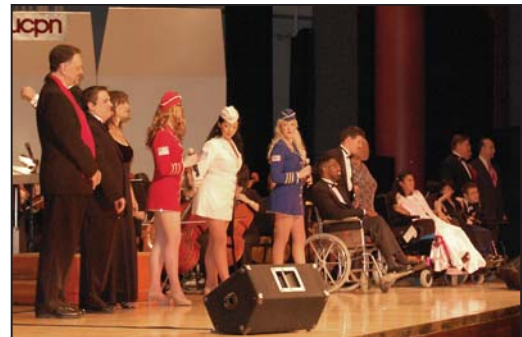
The entire cast on stage for the finale, God Bless America.