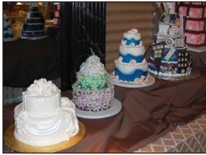
Cakes from Sweet Karma, East Meadow