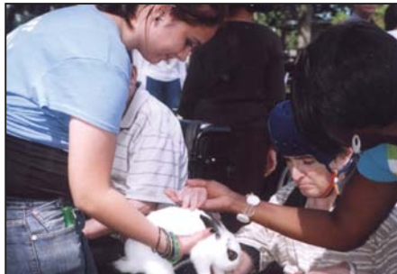
Consumers from ucpn 's ADT program enjoyed petting the bunnies and other visiting animals.

The Adult Services Day Program was the recipient of a generous donation by the agency's California Closets Curiosity Thrift Shop that enabled the adult consumers to enjoy an interactive program hosted by a mobile petting zoo, Tony the Pony and the Barnyard Buddies. The program was facilitat-