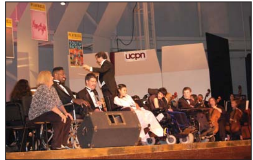
Creation on stage at the Tilles Center

and appreciation for all that he and the whole Nassau Pops organization has done on behalf of ucpn .