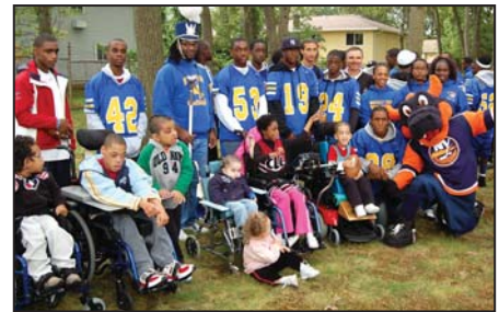
At the Annual Homecoming Celebration Fall Festival at the Children's Learning Center, students from the Marching Band and the Varsity Football team at Roosevelt High School join Islander's mascot, Sparky and CLC students and faculty.