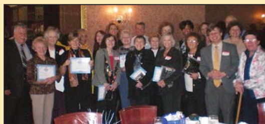
The 2008 ucpn Volunteer Appreciation Luncheon at the City Café.

Speaking of... our volunteer-driven special events are right around the corner, and everyone is enthusiastic about donating their time and energies to The Teddy Bear Tea, Breakfast with Santa, Sugar Plum Ball, and of course, Festival of Trees. We welcome and truly appreciate all of your help, and hope that you will contact our department if you would like to be part of the volunteer festivities. All your enthusiasm reflects back on the exciting and heartwarming fundraisers you help us run. Have a wonderful holiday season!