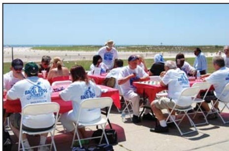
Checkers at the sea shore makes you feel like a king!