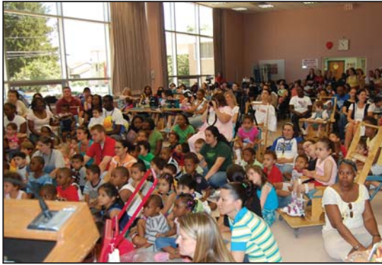
The entire student body was delighted by the performance.