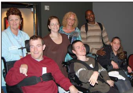
Friends of Creation from the Levittown ucpn residence enjoyed the concert