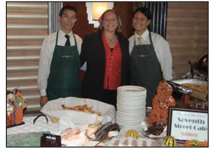
Seventh Street Cafe, Garden City