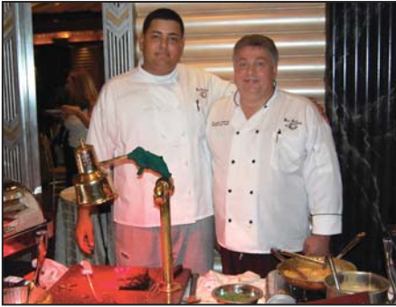
Fox Hollow, Woodbury