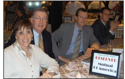
Event sponsor, Mutual of America gathers at their table