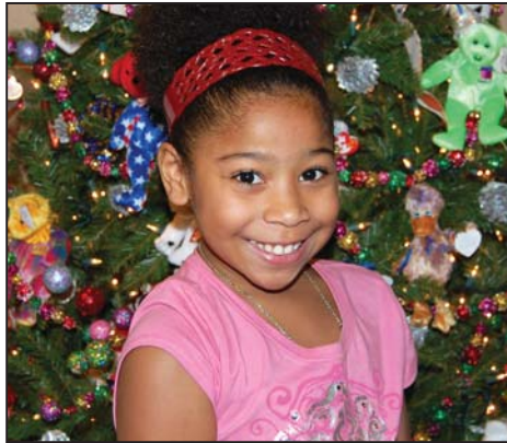
Festival of Trees brings out the smiles in everyone!

The official kick-off to the holiday season, ucpn 's Long Island Festival of Trees, has become a holiday tradition for Long Islanders every Thanksgiving weekend. Treat your family to a spectacular event and begin your holiday shopping – all while giving a present that cannot be wrapped – the gift of your caring and support to the 2,000 children and adults that benefit from the programs and ser-