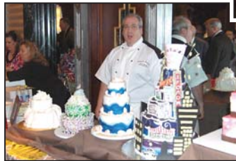
Sweet Karma's spectacular cakes always amaze guests!

For more information contact Charles Evdos at 516-378-2000 ext 648 or at cevdos@ucpn.org