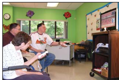
Some of the consumers from Class 416 enjoy bowling on the newly donated Wii system.