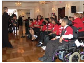
The CLC Chorus inspired all in attendance