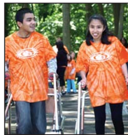
Team CLC participated in the annual Empire State Games for the Physically Challenged.