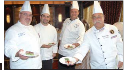
Judges from the ACFLI will be on hand again this year.

Gourmet Food and Wine Tasting on September 16th to Benefit the United Cerebral Palsy Association of Nassau County, Inc. (ucpn)