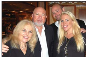
Guests always enjoy this great evening of tasting and helping ucpn!