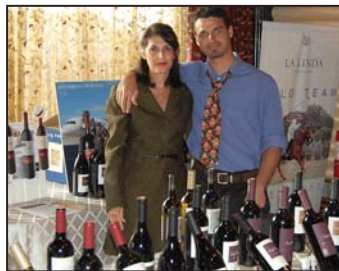
Testa Wines is back again as an event Sponsor.