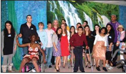
"Swinging Safari," this year's CLC Prom theme was enjoyed by all, teen students as well as teen volunteers.