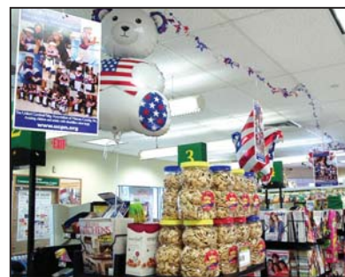
Posters featuring the CLC Ballet Club were on display at all registers.