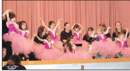
Dancers from the Children's Learning Center's Ballet Club touched hearts at their first-ever recital at ucpn

When she first arrived at the CLC, her teachers noticed that she was withdrawn and, in many ways, fearful. Still, they worked patiently with her, ever alert for a way to reach her. Eventually, they discovered that