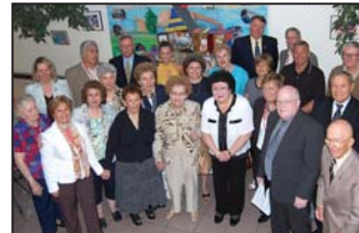
Members of the Victory 100, individuals who have generously volunteered 100 or more hours at ucpn, gather at the Annual Meeting.