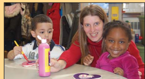
Students from Class 522 at CLC made handpainted valentine hearts for the Valentine's Day Dinner Dance fundraiser hosted by the Auxiliary Junior League volunteers.