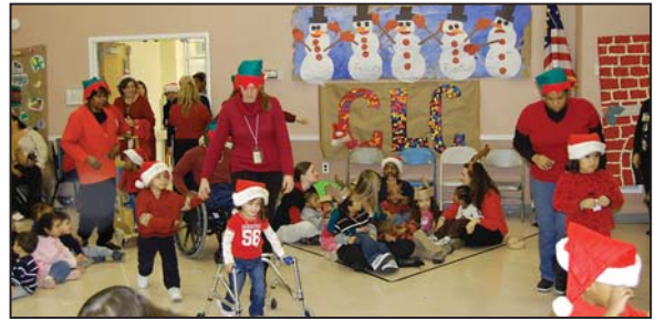
Members of Class 522 travel to the stage for their performance.