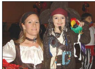
"Treasure this Moment" - Costume prize - Best Couple