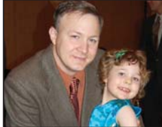
Enjoying time with Dad at the Ball