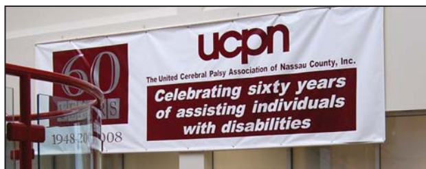
This banner on display in the ucpn atrium area is just the start of special touches around the agency in celebration of the 60th anniversary.

A look at the more recent highlights and developments of the last decade will appear in the next edition of Center Square.