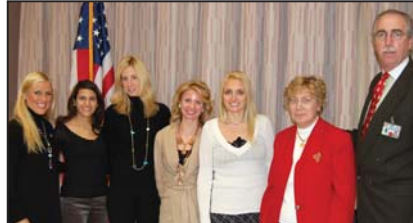
ucpn Junior League members get sworn in at the Auxiliary Holiday Luncheon.

of hard-working fundraising efforts, will be used to benefit consumers receiving services at ucpn .