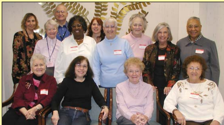
At the Annual ucpn Volunteer Luncheon