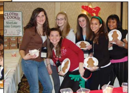
Teen volunteers helped our young guests at the Festival's "Clothe-A-Cookie" area with their creations.