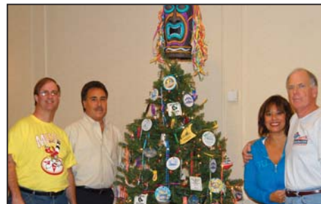
The "Key West" tree is an annual favorite each year thanks to the creative Metro Parrot Head Club members.