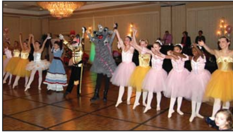
The Leggz Ensemble was the highlight of the Ball with their spectacular "Waltz of the Flowers" and waltzing lessons for all!