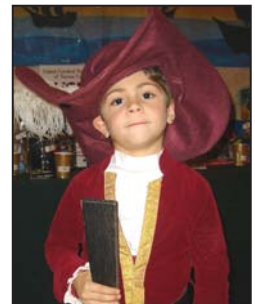
Best Costume - young pirate

O n December 2nd, the Grand Ballroom of the Uniondale Marriott was the setting of the Council of Auxiliaries popular fundraiser, A Knight to Remember , with the theme this year being "A Pirate's Adventure." With colorful and creative decorations, the room was transformed into a tropical island complete with pirate ships, palm trees, parrots and buried treasure.