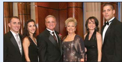
The Tavella Family