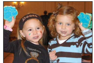
Thanks to Silver Lake cookies, guests enjoyed yummy teddy bear cookies at the Teddy Bear Tea.