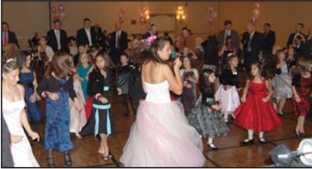
The Sugar Plum Fairy and the Snowflake Fairy lead the young ladies in a dance at the Sugar Plum Ball.