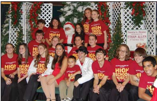
The Kids Performing Who Kare got rave reviews for their excerpts from High School Musical at the Festival.