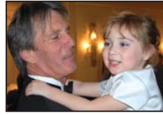
Priceless Dad-Daughter moment at the Sugar Plum Ball.