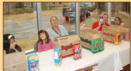
Members of the Girl Scout Troop 1229 here at CLC selling cookies along with their troop leaders. This troop is unique as the only one for young ladies with disabilities in Nassau County.