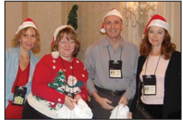
Volunteers help make our events fun for all!