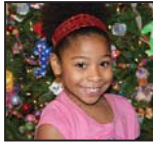
Feeling the joy that Festival brings!