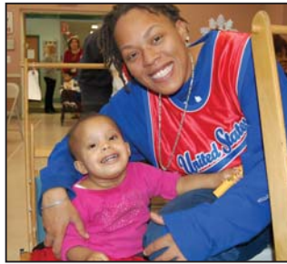
Enjoying the CLC Holiday concert.