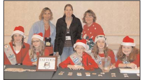
Girls scouts helped with tattoos at the Breakfast with Santa and the Teddy Bear Tea.