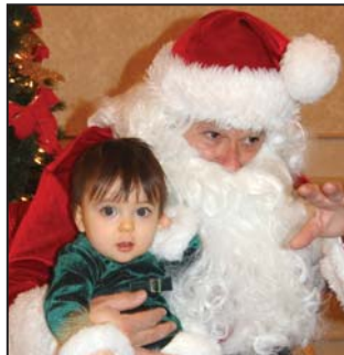
Enjoying time with Santa!