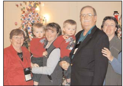
The Gaughran family came to Festival as volunteers and as guests to enjoy all the festivities!