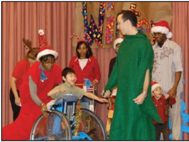
Decorating the holiday "tree".