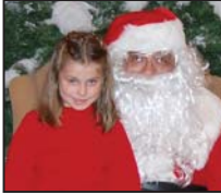
Enjoying a talk with Santa.