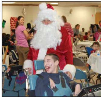
Santa made a special visit to the CLC Holiday party.