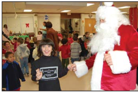
Smiles galore at Santa's arrival.