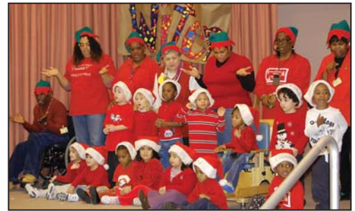
Staff and students from Class 528 express their joy at holiday time!