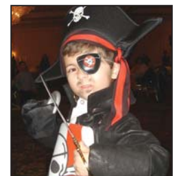
Most Original Costume

To be placed on our mailing list call 516-378-2000, ext. 220 or log on to our website at www.ucpn.org .