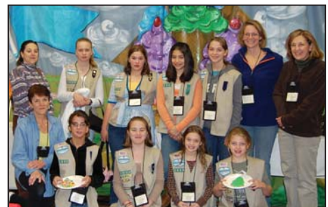
Girls scout volunteers also helped in the cookie area at the Festival.