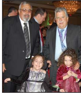
Some little princesses enjoy the Ball with their grandpas.