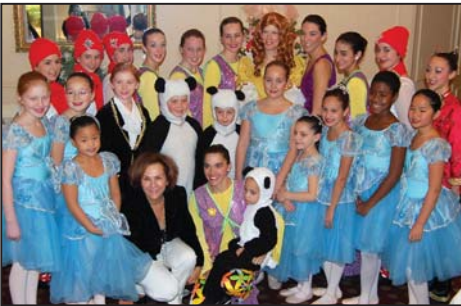
The ensemble from Leggz Dance in Rockville Center delighted the audience with a variety of performances at the Festival!