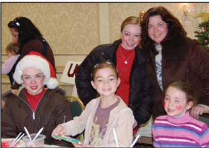
The dancers from the Ella Marie School of Dance take time after performing to decorate cookies at the Festival.